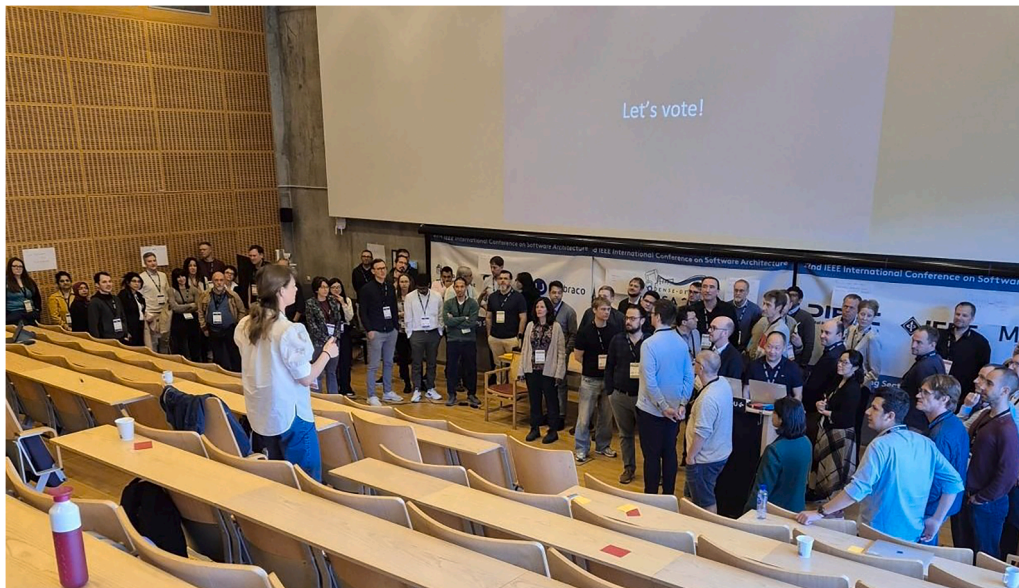
Fig. 1. The working session at ICSA 2025.

In contexts demanding urgent solutions, clear industry value and practical relevance may outweigh originality as an academic value – without diminishing the importance of originality in the long term. Relevance is a relative measure, and there is gradation in the short-medium term, ranging from few months to a few years. It can have high relevance to directly use a research prototype in an industrial